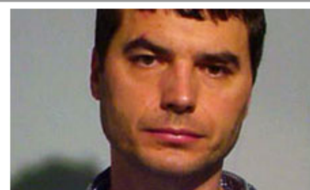
3 cops hurt during cement attack, arrest