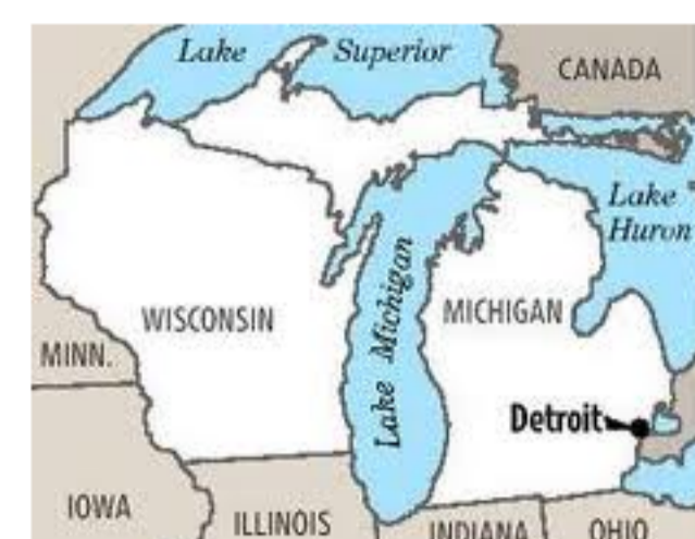
Michigan gives thumbs-down to Wisconsin mitten campaign

Comments 30 Share 3494 5 Tweet 86 Recommend 632